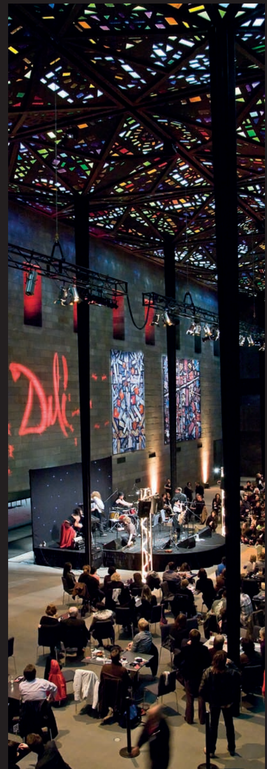
IMAGE: Visitors enjoying Dalí art after dark